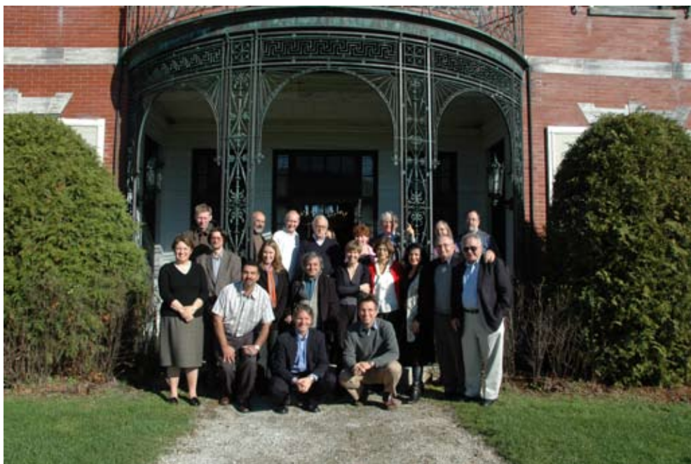
Figure 1.1. Participants at the TAARII Workshop at Elm Tree House, Williams College.