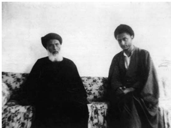
Figure 2.2. Sayyid Musa al-Sadr and Sayyid ‘Abd al-Husayn Sharaf al-Din in 1955

All of these individuals were students in Najaf during the formation of the first revolutionary Shi‘i Islamist party, Hizb al-Da‘wa al-Islamiyya (around 1957 or 1958), for which Baqir al-Sadr is often cited as the central intellectual and political force. While Shams al-Din and Fadlallah remained in Najaf until the ages of 33 and 31, respectively, Musa al-Sadr’s period of study was much