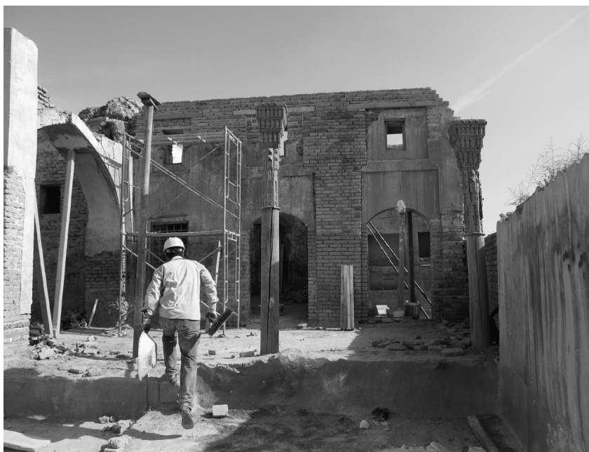
Figure 5.5. (Below) Tomb at Shaykh 'Adi shrine, Lalesh, 19 April 2013