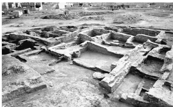
Figure 2.1. Overall view of Iraqi excavations at Tell Muqtadiyah, Diyala province

With an increased level of funding under the IRD grant, we expanded