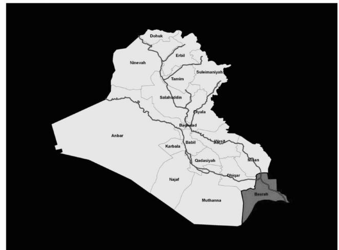
Figure 1.10. Basrah province in Iraq