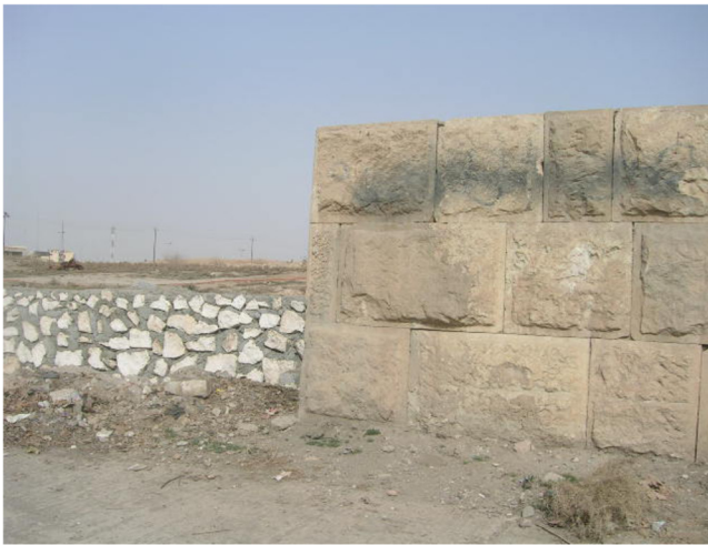
Figure 1.5. The walls of Nineveh