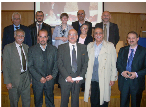
Figure 4.1. Participants in the TAARII/SRF proposal-writing workshop, January 7–8, 2010, Amman.