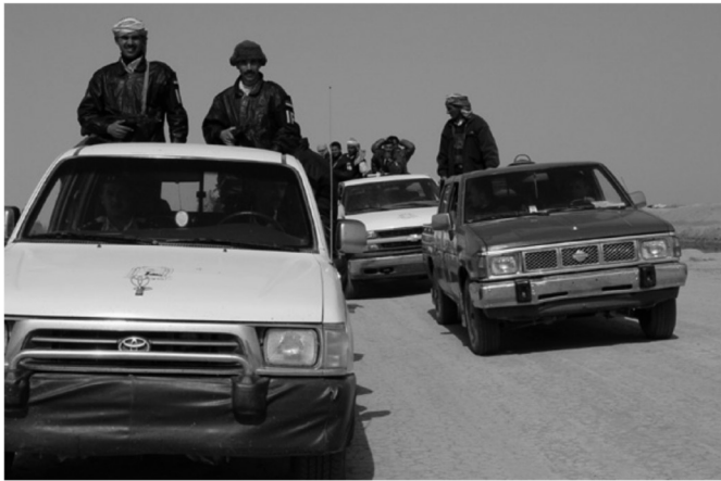
Figure 1.7. The Antiquities Police, which is no longer functioning