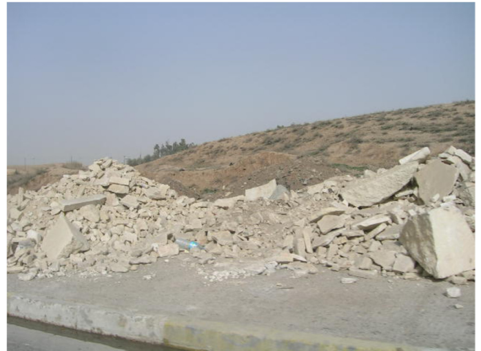
Figure 1.4. The walls of Nineveh