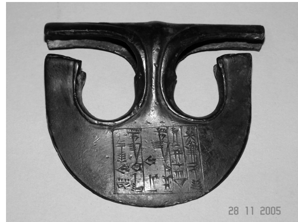
Figure 1.8. Sumerian axe head seized by the German Federal Police and returned to Iraq in March 2009

lets, which, according to the constitution should be sent to the Iraq Museum where they could be conserved and kept in suitable conditions. However, he was afraid that the governor of the Qadasiyah province would try to stop him. He therefore resorted to smuggling his finds to Baghdad — even though they were the result of an official excavation. He was able to transport the material to the Iraq Museum in several trucks belonging to local farmers, using back roads rather than the major highways and thus avoiding the checkpoints established by the governor to prevent such objects from leaving the province. Only in this way was he able to take all the material he found in his official excavations to the Iraq Museum in Bag-