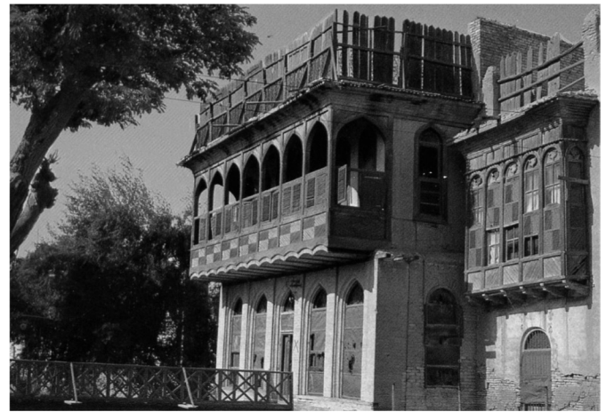
Figure 1.11. One of the historic houses in Basra

In Baghdad, the traditional buildings that have a very special Iraqi architecture from the nineteenth century and early twentieth century have been neglected and therefore destroyed by their owners in order to build modern structures for commercial purposes, especially on Rashid Street. Now, with