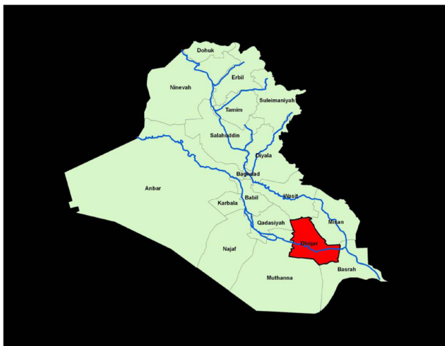
Figure 1.1. Dhi Qar province in Iraq. All maps arranged by Elizabeth Stone

Eventually we managed to have a paragraph included in the constitution. Paragraph Number 113 stated: "The antiquities are the heritage and wealth of the Iraqi people and they should be