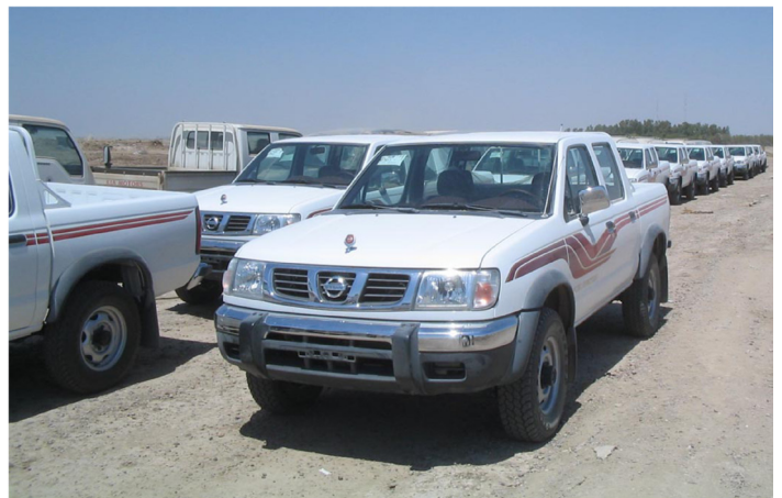
Figure 1.6. The cars donated by the U.S. and Japan

dealt with by the central government according to the law,” and that law was already in place.