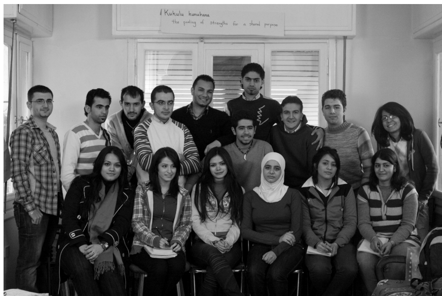
Figure 3.1. Iraqi students at their weekly Writers' Workshop in Damascus, December 2009. Through the Iraqi Student Project, sixteen students hope to be studying at colleges in the U.S. in the fall of 2010.

Most of the study is done in small groups, but every Friday all the students gather (16 of them this year) for the Writers' Workshop and for an ISP meeting. The latter often gets into everything from residency requirements