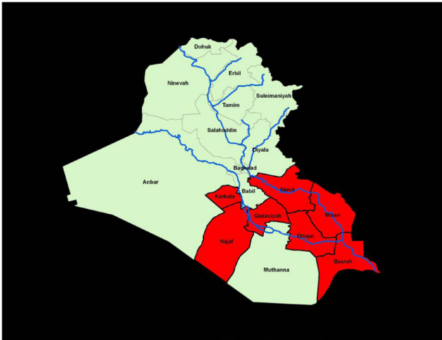
Figure 1.3. The provinces of Karbala, Najaf, Basra, Wasit, Dhi Qar, Qadasiyah, and Misan in Iraq